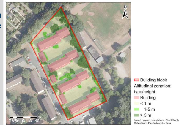
Figure 1 Urban altitudinal zonation analysis of urban structure type: Terraced houses (1950s-60s).

These results are important to improve the resilience, especially in residential environment and thus to be better prepared for future developments. In addition, a heterogeneous altitude zone structure promotes general and mental health (Juergens & Meyer-Heß 2020). These findings come from the joint research project “IMECOGIP” funded by the BMBF. In future applications the traffic areas and LiDAR data itself should be integrated into the analysis.